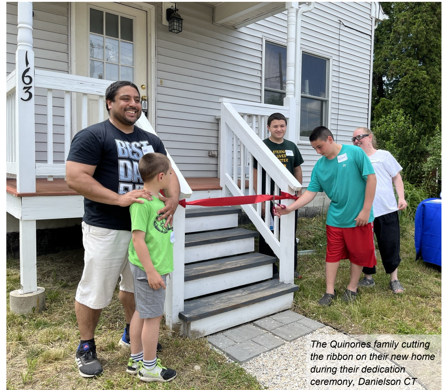
The Quinones family cutting the ribbon on their new home during their dedication ceremony, Danielson CT

www.habitatect.org | 860-442-7890 | mission@habitatect.org