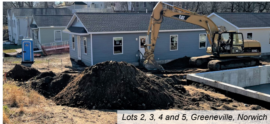
Lots 2, 3, 4 and 5, Greenville, Norwich

THE NEWSLETTER BY HABITAT FOR HUMANITY OF EASTERN CONNECTICUT